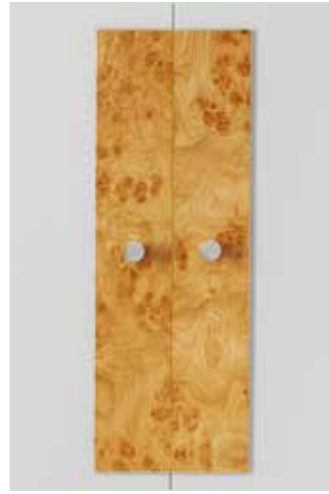
Accent Oak/Burr Oak