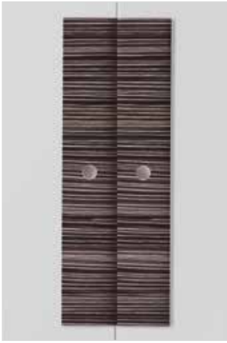
Accent Black & White Zebrano

Add design contrast to a plain door by design accent veneer inserts. Inserts can be located centrally, top or bottom corner of door (opposite to hinged side). 26mm solid timber with face veneer, rebated over door cut-out. Separate handle should be specified for fitment through the design accent inserts.