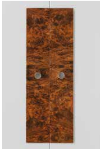
Accent Walnut/Burr Walnut