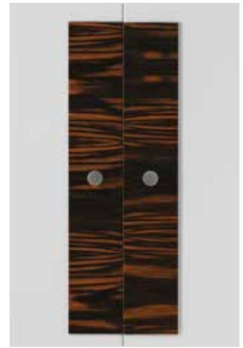
Accent Walnut/Ebony Macassar

Accent heights available – 300x100, 500x100, 700x100, 900x100. (See section 7 for model codes and pricing). Ranges this can be specified on are: FUSION, AMBIENCE, ELAN, DIFFUSE, INFINITY.